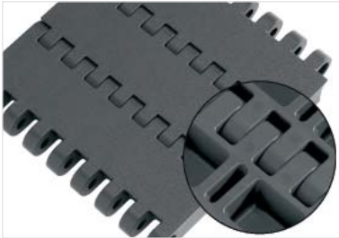
M6420 2.5" pitch

The multifunctional skid conveyor system for loading areas, queuing of products, body shop, paint shop and final assembly operations is nowadays equipped with light weight conveyor belts in comparison with the formerly used heavy and greasy metal chains.