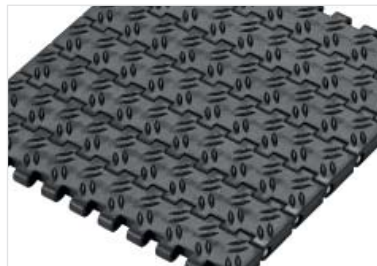
M2423 1" pitch