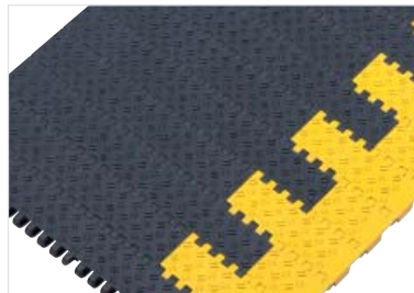
M5023 2" pitch