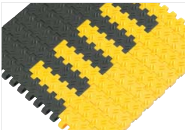
M2623 1" pitch