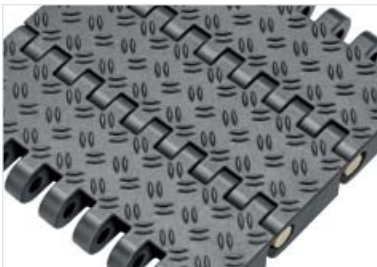
M6423 2.5" pitch

Traditional heavy rubber conveyor belts with steel cord members had a lot of disadvantages. Habasit's alternative solution: modular or fabric based people mover belts.