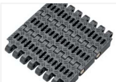
M6424 2.5" pitch