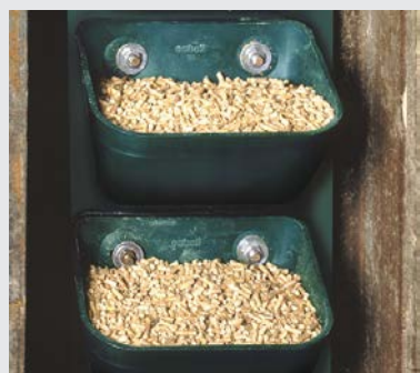
Buckets fitted to a belt conveying fodder.

Our elevator belts offer resistance to abrasion, vegetable oil and fats and mineral oils. All white belts are completely non-toxic and meet FDA requirements. The smooth, regular covers are less adherent to the conveyed products than classic rubber or rubber-canvas belts.