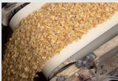
ESPOT belt working in a cereal factory.